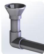
▪ Cone diffuser