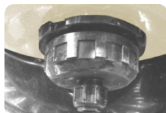
▪ Sand drain 2 ½"