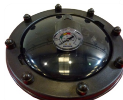
▪ Black top lid with screws