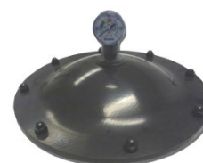
▪ Top Ø400 manhole on 1050 and 1200 models