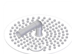
▪ Nozzle plate