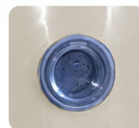
▪ Optional sight-glass